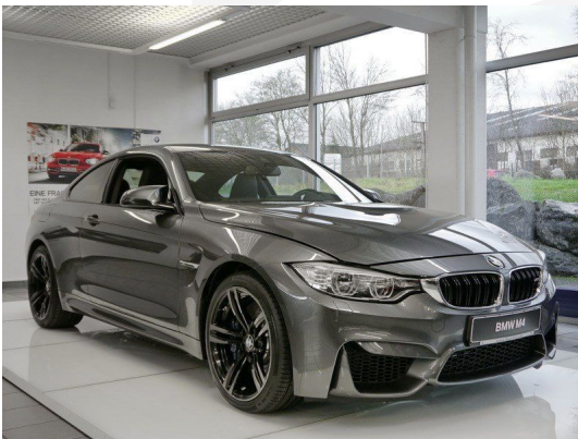
Figure 2: Using a PNG as figure.

SVGs can be scaled as required. Giving best results with any print output.