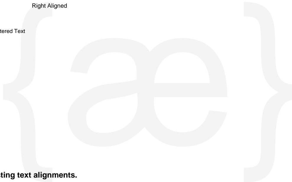
Figure 4: Testing text alignments.