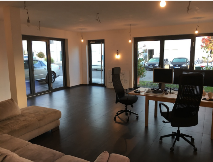
Figure 3: Using an JPG as figure.